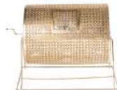
Prize Draw Barrell - Gilt Stock Code: E0312