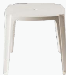
75cm Sq' Stackable Patio Tables