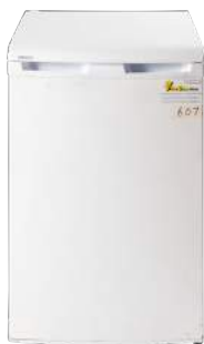
Refrigerator - undercounter