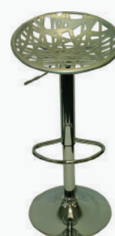
Silver Republic Stool Stock Code: 785S h 660-870 | w 415 | d 410