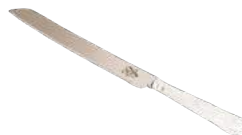
Silver Cake Knife Stock Code: C1588