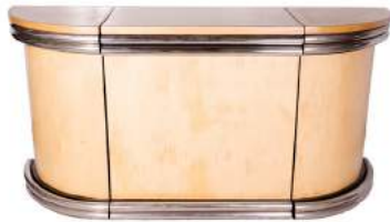
Mercury Bar Natural Front Section Stock Code: 612 h 1080 | w 605 | d 605