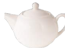
Plain Ball Shaped Tea Pot 1 Lt - 35 ozl Stock Code: C0035