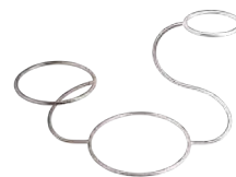
3 Tier "Swan" Cake Stand Stock Code: C2070D