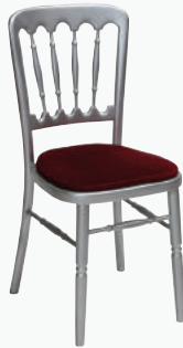
Wooden Framed Banqueting Chair