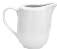
Half pint cream jug Stock Code: C0407