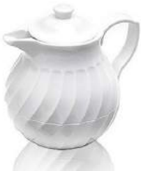
1.2 Lt White Vacuum Jug Stock Code: C2726