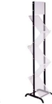
Mesh Literature Rack Stock Code: 309 h 1407 | w 280