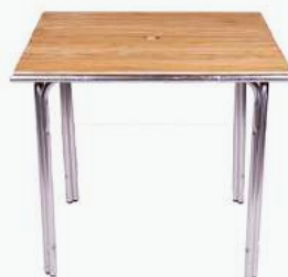
Square Teak & Aluminium Table