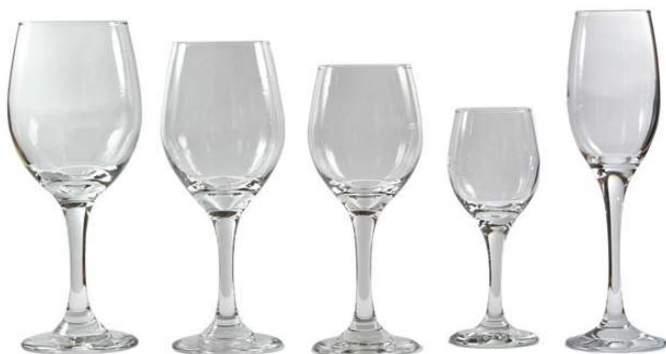
Perception Goblet 14 oz