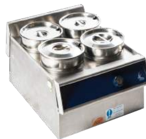
4 Pot Bain Marie Electric

Stock Code: C2334 w 45cm | d 65cm | h 30cm