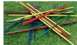
Giant Pick up Sticks