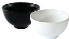
Black 4.5" Round Rice Bowl