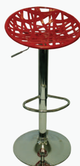
Red Republic Stool Stock Code: 785RD h 660-870 | w 415 | d 410