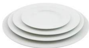
12" Plate Stock Code: C0407