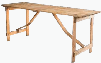
Wooden Table 6'x2'

With wooden legs Stock Code: E27 h 750 | 400 | w 1830 | d 600