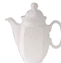
Coffee Pot 30oz (85 cl)