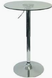
Moonlight Glass Poseur Table