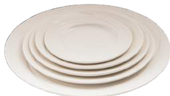
12.5" Plate (32cm) Stock Code: C0460