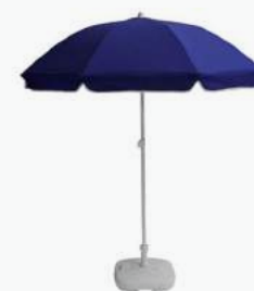
Navy White Edge Parasol and Base