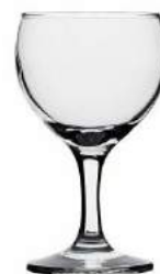
Paris Goblet 6 2/3 oz (18 cl) Stock Code: C0908