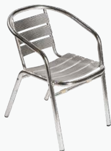
Aluminium Chairs with Arms Stock Code: 68 h 710 | w 500 | sh 440 | d 560