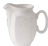
Milk Jug 10oz (28 cl)