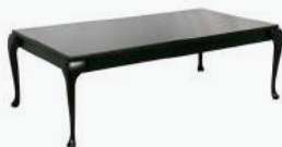
Regency Rectangular Coffee Table Black Stock Code: 604BK h 450 | w 510 | l 510