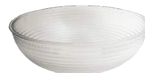
12in Salad Bowl (Plastic) 30cm Stock Code: C1188