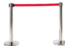
Tensa Expandable Barrier (Red Tape) Stock Code: E200 w 1800