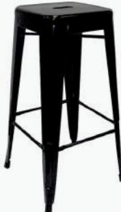
Ikon Bar Stool Black Stock Code: 792BK h 760 | w 430 | d 430