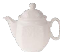
Tea Pot 30oz (85 cl)