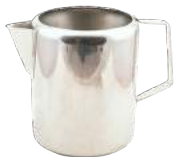
3 Litre Jug s/s