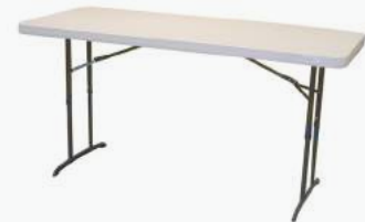
Adjustable Height Utility Table

With wooden legs Stock Code: E27 h 750 | 400 | w 1830 | d 600