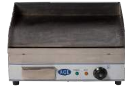
Electric Griddle Plate 550w x 350d Z86002189 Stock Code: C2309A