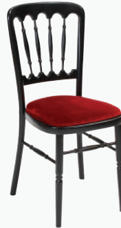
Wooden Framed Banqueting Chair