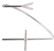
Cake Stand 2 Tier Spiral Stock Code: C0270F