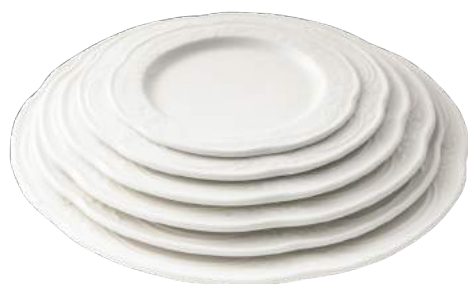
12" Plate (30cm)