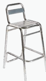
Aluminium Stool Stock Code: 70 h 975 | w 470 | sh 760 | d 550