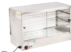
Pie Cabinet (240v) Z8880191

Various sizes and styles available Stock Code: C2304E