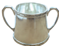
EPNS Sugar Bowl Stock Code: C1473