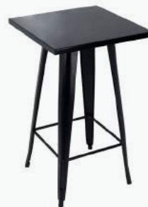
Ikon Poseur Table