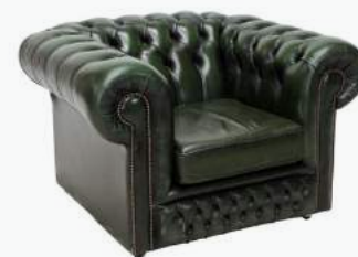
Chesterfield Leather Armchair Green Stock Code: 235GN h 690 | w 1070 | sh 460 | d 910