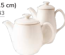
Tea Pot 30oz (85 cl)