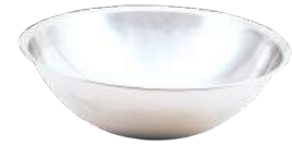
Serving Bowl 12" Dia. s/s (30 cm)