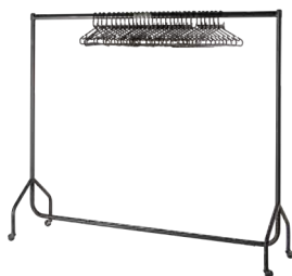
Coat Rail Stock Code: E77 h 1620 | l 1820