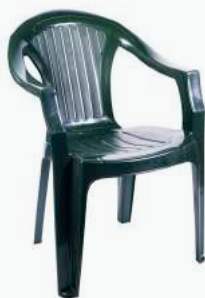
Green Plastic Garden Chairs