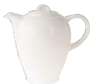
Coffee/Tea Beverage Pot White - 36 oz (102cl) Stock Code: C0144