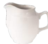
Plain White 1/2 Litre Jug Stock Code: C0178