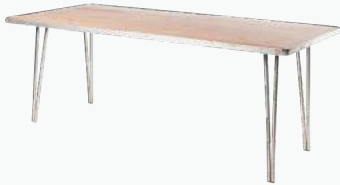
Go-Pak Table 6'x2'