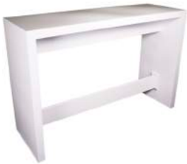
Vision Tasting Table Stock Code: 822 h 1000 | w 500 | l 1500