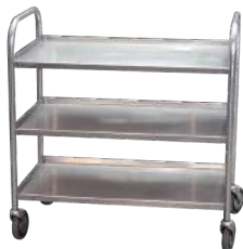
3 Tier Clearing Trolley Stock Code: C2432A