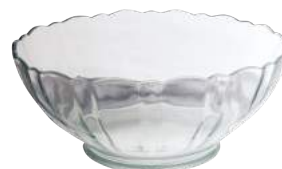
Glass Bowl various sizes & styles available Stock Code: C1108