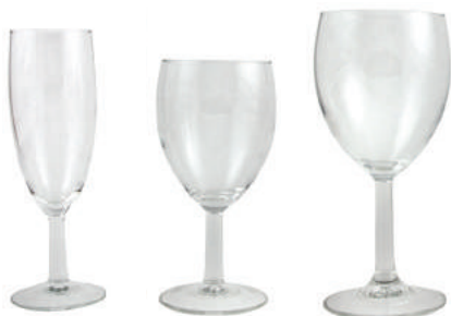
8oz Champagne Tulip