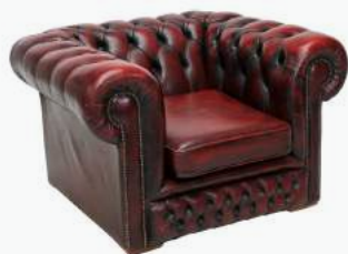
Chesterfield Leather Armchair Burgundy Stock Code: 235BY h 690 | w 1070 | sh 460 | d 910