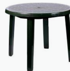
3ft Round Green Plastic Table