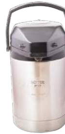
Air Pot Vacuum Flask Stock Code: C2101