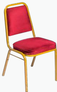
Metal Framed Banqueting Chair Red Stock Code: E0202 h 875 | sh 470 | w 395 | d 430