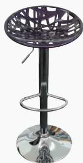
Plum Republic Stool Stock Code: 785PE h 660-870 | w 415 | d 410