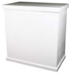
Bar Front White Stock Code: E98WE h 1080 | w 1000 | d 580