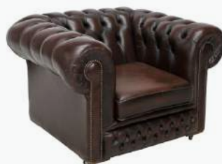
Chesterfield Leather Armchair Brown Stock Code: 235BN h 690 | w 1070 | sh 460 | d 910