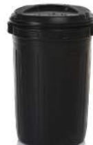
Black Plastic Dustbin Stock Code: C2720