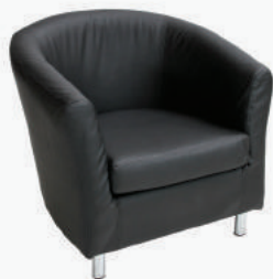
Swedish Tub Leather Chair Black Stock Code: 610BK h 750 | w 800 | sh 380 | d 800