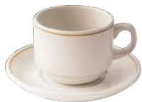
Coffee Stacking Cup Demi Tasse 3.5 oz (10cl)