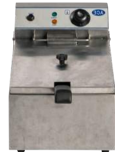
Deep Fat Fryer (Single) Stock Code: C2315