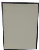
Pin Board Stock Code: SUB0001 h 810 | w 610 | d 20