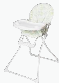
Baby's High Chair Stock Code: E60 h 990 | w 640 | sh 570 | d 740