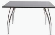
Arizona Rectangular Table