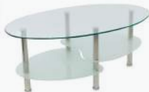
Cara Coffee Table Glass Clear Stock Code: 117D h 580 | w 420 | l 910