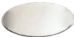
Mirrored Plate Round Stock Code: C1980A

Also available with a mirrored top Stock Code: C1424A