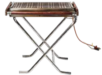
Gas Grill BBQ 3'x2 Stock Code: C2381 Various sizes available 91.5 cm x 60 cm