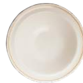
Fruit Dish (15.25cm)