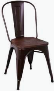
Ikon Chair Brown Stock Code: 793BN h 850 | sh 440 | w 355 | d 425