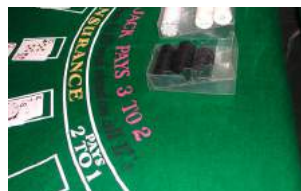
Black Jack Game