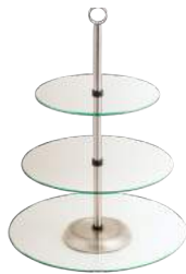
3 Tier Glass Cake Stand (30cm base / 25cm mid / 21cm top - 39.5 cm High) Stock Code: C1185