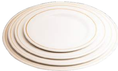
10" Plate (25cm)