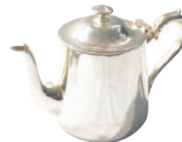
1 Pint EPNS Teapot