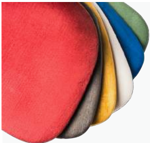
Seat Pads Available Gold: E57H Green: E57M Burgundy: E56T Royal Blue: E57D Black: E57K Ivory/Cream: C3449