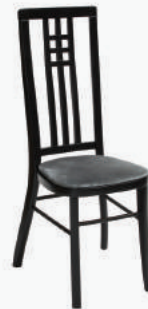
High Back Banqueting Chair