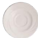
Alvo Demi Tasse Saucer Stock Code: C0470