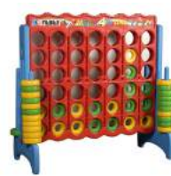
Giant Connect 4