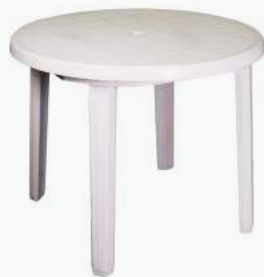
Round Patio Table 3' (90cm)