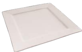
11" White Square Plate (27cm) Stock Code: C0228