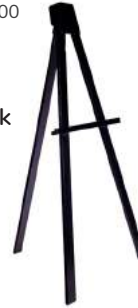
Wooden Easel Black Stock Code: 72 h 1750 | w 645 | d 945