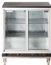
3'x3' Stainless Steel Bottle Cooler

2 Shelves-Holds 174 Bottles Stock Code: C2411