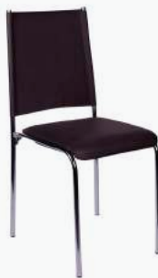
Lorenzo Chair Brown Leather Stock Code: E85 h 930 | sh 470 | w 400 | d 430