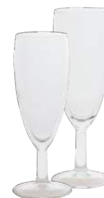
Banqueting Champagne Flute 6 oz (17 cl) Stock Code: C1181