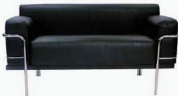
Corbousier Leather Sofa h 740 | w 1555 | sh 465 | d 960