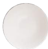
Oatmeal Dish (16.5 cm)