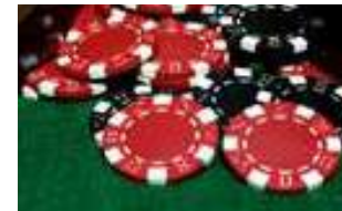
Coloured Betting Chips (80)