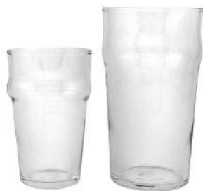
Half Pint Nonik (28 cl) Stock Code: C0911