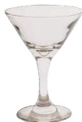
Martini Glass 1.5 oz (14 cl) Stock Code: C1020