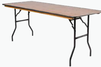
Wooden Top Table 6'x2'