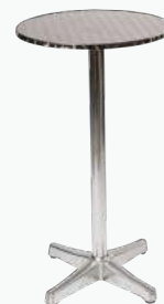
Aluminium Poseur Table Stock Code: 69B h 1100 | dia 595