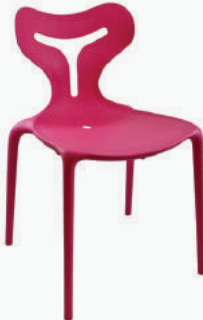
Inside Out Chair Pink Stock Code: 367PK h 800 | sh 450 | w 510 | d 500