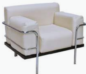
Corbousier Leather Armchair h 740 | w 765 | sh 4650 | d 960