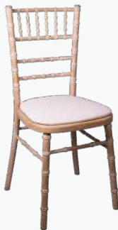
Chiavari Banqueting Chair