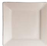
6" White Square Plate (15cm) Stock Code: C0132