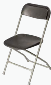
Folding Chair ■ Charcoal Stock Code: E46 ■ Brown Stock Code: E46BN ■ Gold Stock Code: E46GD ■ White Stock Code: E46A h 790 | sh 445 | w 445 | d 535