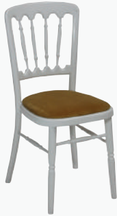
Wooden Framed Banqueting Chair