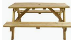
Picnic Bench with Table Teak