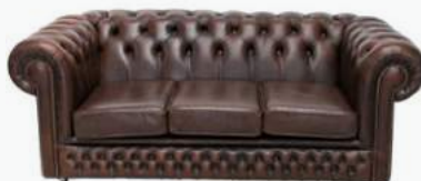
Chesterfield Leather 3 Seater Sofa Brown Stock Code: 236BN h 690 | w 1980 | sh 460 | d 910