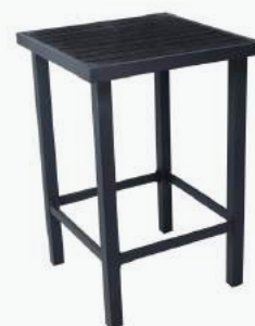
Lithium Poseur Table