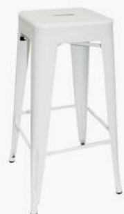
Ikon Bar Stool White Stock Code: 792WE h 760 | w 430 | d 430