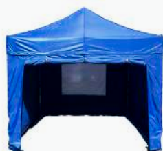
Gazebo Blue Stock Code: E84 h 3000 | l 3000