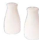
Shaped Salt Pot Stock Code: C0145