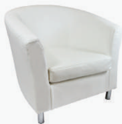
Swedish Tub Leather Chair White Stock Code: 610WE h 750 | w 800 | sh 380 | d 800