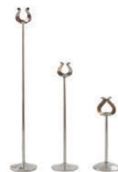
Table Number Stand 12" High (30 cm) Stock Code: C2095