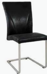
Cosmo Cantilever Chair Black Suede Stock Code: E130 h 940 | sh 480 | w 420 | d 470