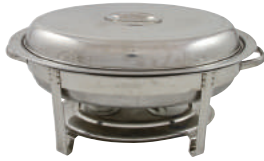
Chafing Dish 20" Oval (50 cm)