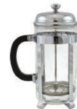
Chrome Cafetiere 12 cup