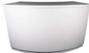
Bespoke Circular Bar Stock Code: 761 h 1100 | length of curve of 1 unit 1900 dia full bar 3600