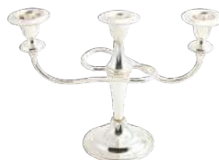
Silver Candelabra 3 Stem (fixed) Stock Code: C1564