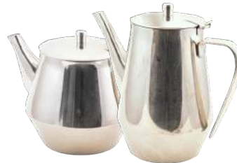
Tea Pot 70oz s/s (200 cl) - 10 Cups