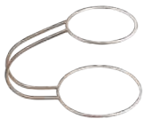
2 Tier Cake Stand Stock Code: C2070B