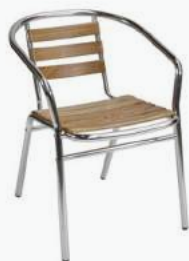
Teak & Aluminium Chair