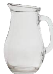
Glass Water Jugs 1.4 lt Plain Stock Code: C1186