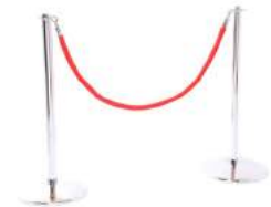
Barrier Post Stock Code: 346A h 950 | Base dia 320 | Pole dia 50