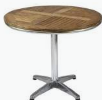
Round Teak & Aluminium Table