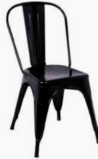
Ikon Chair Black Stock Code: 793BK h 850 | sh 440 | w 355 | d 425