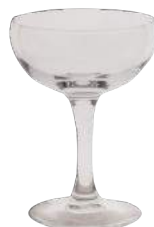
Champagne Saucer (14.2cl) Stock Code: C1182