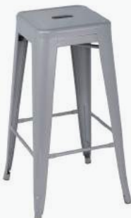
Ikon Bar Stool Silver Stock Code: 792S h 760 | w 430 | d 430