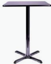
Pisa Square Poseur Table