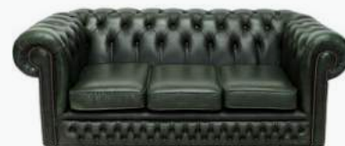
Chesterfield Leather 3 Seater Sofa Green Stock Code: 236GN h 690 | w 1980 | sh 460 | d 910