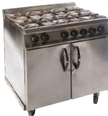
6 Ring Propane Gas Burner Oven

Stock Code: C2301E w 13" | d 13" | h 18"