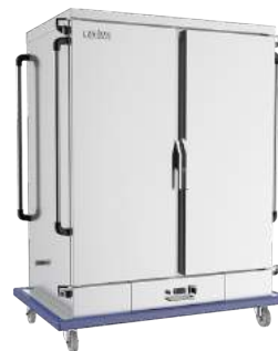
Hot Holding Cupboard

2 Shelves-Holds 174 Bottles Stock Code: C2411