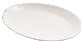
12" (30 cm) Oval Plate Stock Code: C0032