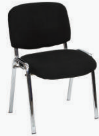
Sierra Linking Conference Chair Black Stock Code: 158A h 800 | sh 470 | w 550 | d 550