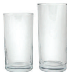
6oz Slim Jim 6 oz (17 cl) Stock Code: C1183