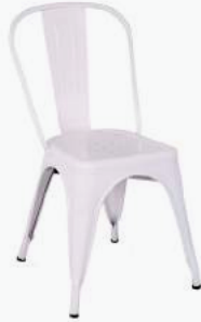
Ikon Chair White Stock Code: 793WE h 850 | sh 440 | w 355 | d 425