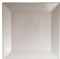
11" Lubiana Sq. White Plates (27cm) Stock Code: C0037