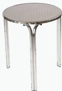
Aluminium Stacking Patio Table- 23.5" Stock Code: 67A h 7120 | dia 595