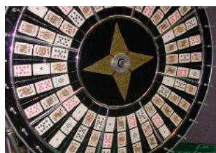
Wheel of Fortune (Dice)