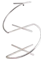
Cake Stand 3 Tier Spiral Stock Code: C0270E