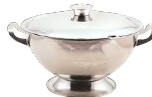
8 Pt. Soup Tureen (448 cl)