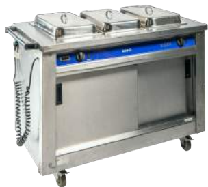
Hot Cupboard Bains Marie Top

Various sizes and styles available Stock Code: C2304E