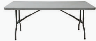
6ft Plastic Utility Table