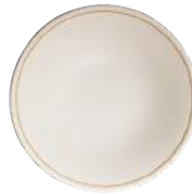
Oatmeal Dish (16.5 cm)