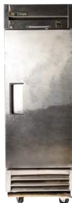
Solid Door Refrigerator

Stock Code: C2383 l 686" | d 623 | h 1995 | 4 Shelves