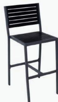
Lithium High Stool