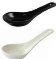
White Rice Spoon