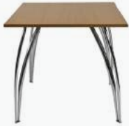
Arizona Square Table