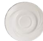
Alvo Saucer Stock Code: C0469