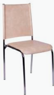
Lorenzo Chair Ivory Leather Stock Code: E86 h 930 | sh 470 | w 400 | d 430