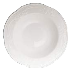
Soup Dish (21.5 cm)