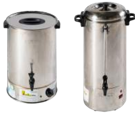
6 Gallon Boiler Electric (30 lt) Stock Code: C2319