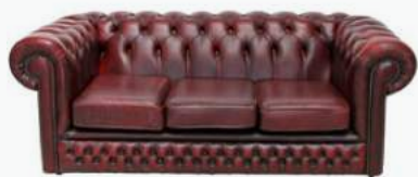
Chesterfield Leather 3 Seater Sofa Burgundy Stock Code: 236BY h 690 | w 1980 | sh 460 | d 910