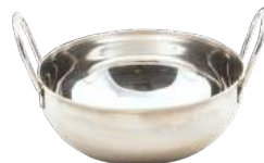
Balti/Kadai Dish 6.3/4"