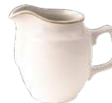
Milk Jug 10oz (28 cl)