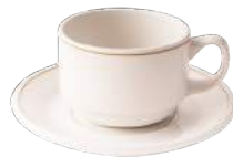
Stacking Cup 7oz (20 cl)