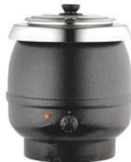
WET HEAT - 10Ltr Soup Kettle Stock Code: C2308A h 360mm | dia 345mm