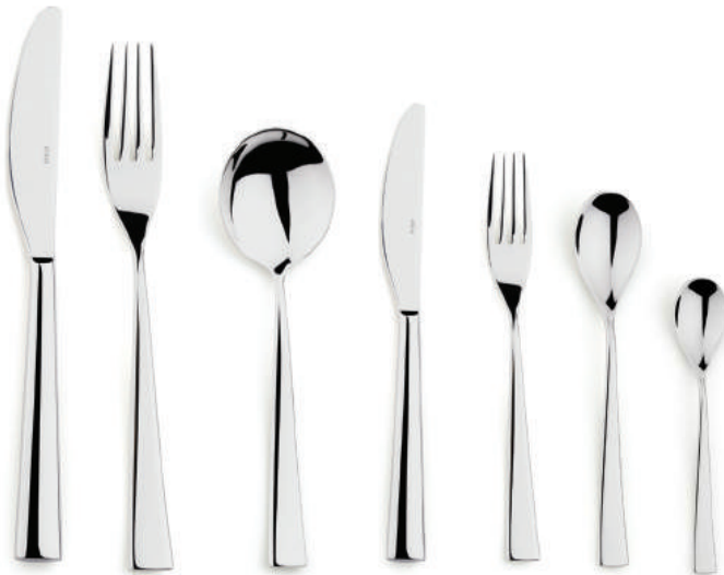
Table Knives Stock Code: C1220