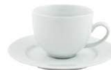
Tea Cup Stock Code: C0409