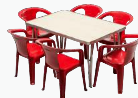
Child's Table 3'x2' Stock Code: E0207 h 510 | w 610 | l 910