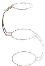
3 Tier 'S' Cake Stand Stock Code: C2070