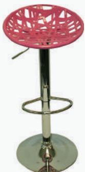
Pink Republic Stool Stock Code: 785PK h 660-870 | w 415 | d 410