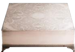
Silver Cake Stand 14" Square (35 cm) Stock Code: C1424

Also available with a mirrored top Stock Code: C1424A