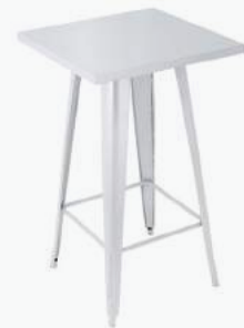
Ikon Poseur Table