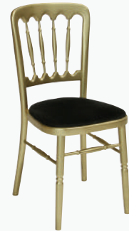
Wooden Framed Banqueting Chair