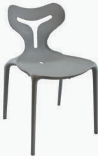
Inside Out Chair Grey Stock Code: 367GY h 800 | sh 450 | w 510 | d 500