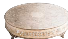
Silver Cake Stand 14" Round (35 cm) Stock Code: C1428