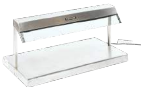
Heated Display Unit 3 Light

Stock Code: C2334 w 45cm | d 65cm | h 30cm