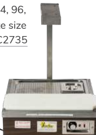
Counter Top Carvery Unit Stock Code: C2370