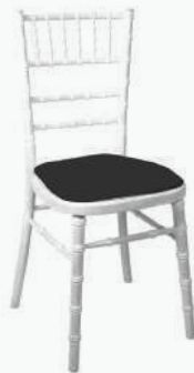
Chiavari Banqueting Chair