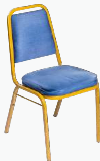
Metal Framed Banqueting Chair Blue Stock Code: E0205 h 875 | sh 470 | w 395 | d 430